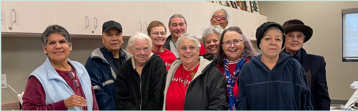
RSVP volunteers from the Java Program.