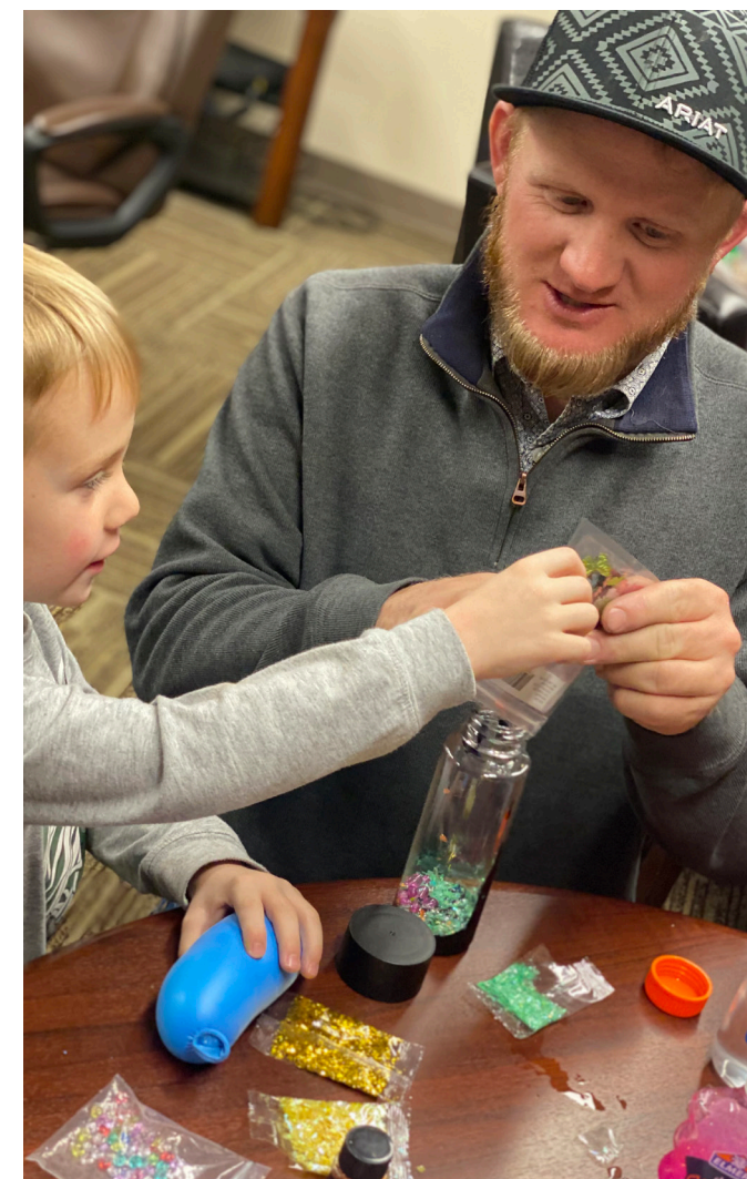
Social-Emotional Parent Training at the Wells Family Resource Center